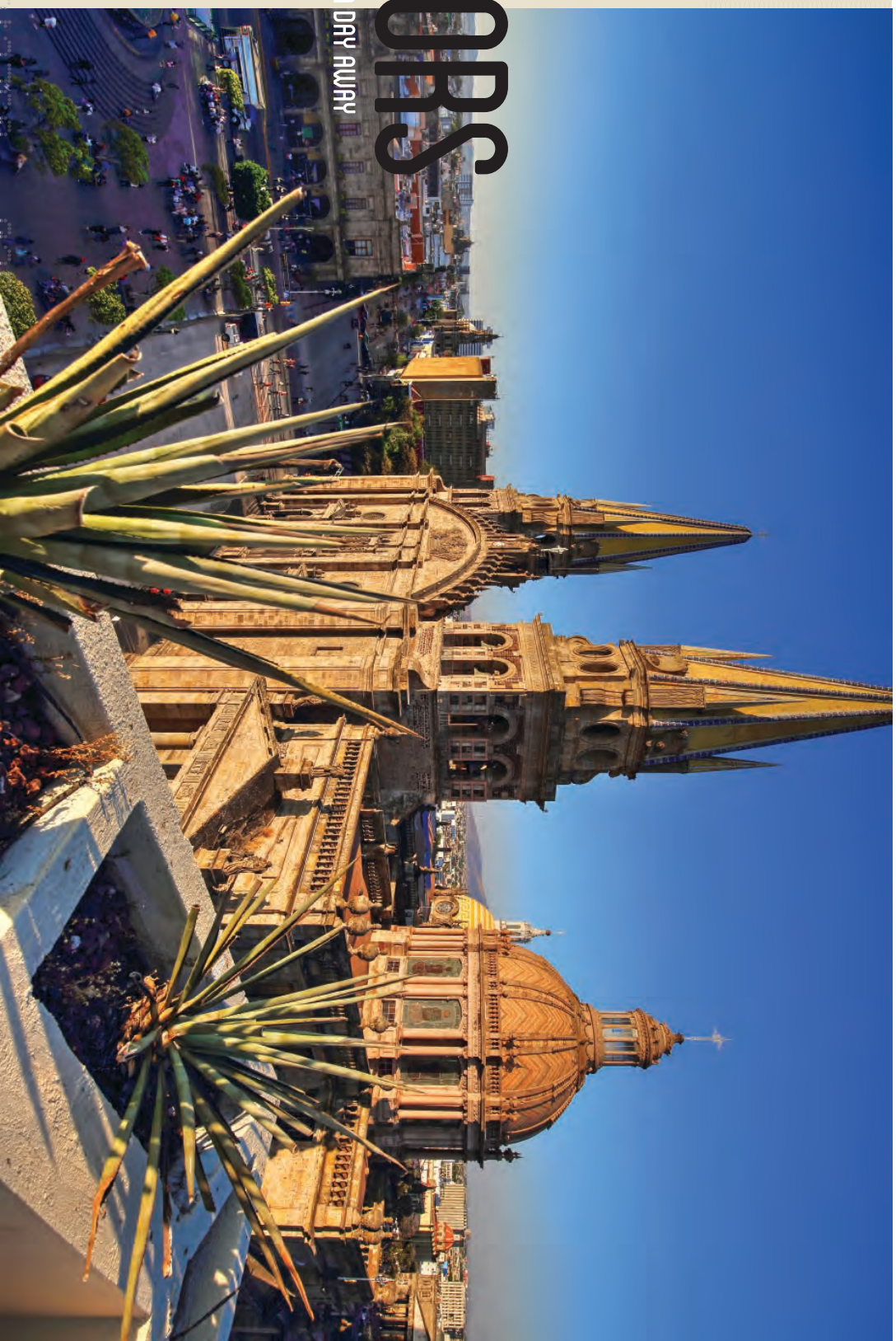
Guadalupe Cathedral, Cathedral Metropolitana de Guadalupe

How many times have you heard—especially lately—that the world is getting smaller? It seems that way sometimes—Americans are familiar with towns like Jalalabad and Karachi, names we'd never heard of until the past decade. So, considering our familiarity with these faraway places, it seems odd that we know so little about our own neighbors, Canada and Mexico. Seizing several opportunities, the editors of Salt Lake magazine traveled to destinations in these close-by countries and came home wanting to go back. And get to know our neighbors better.